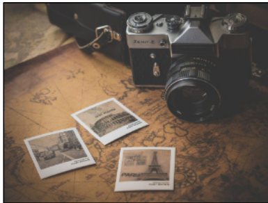
PHOTO LESSONS WHAT TO BRING